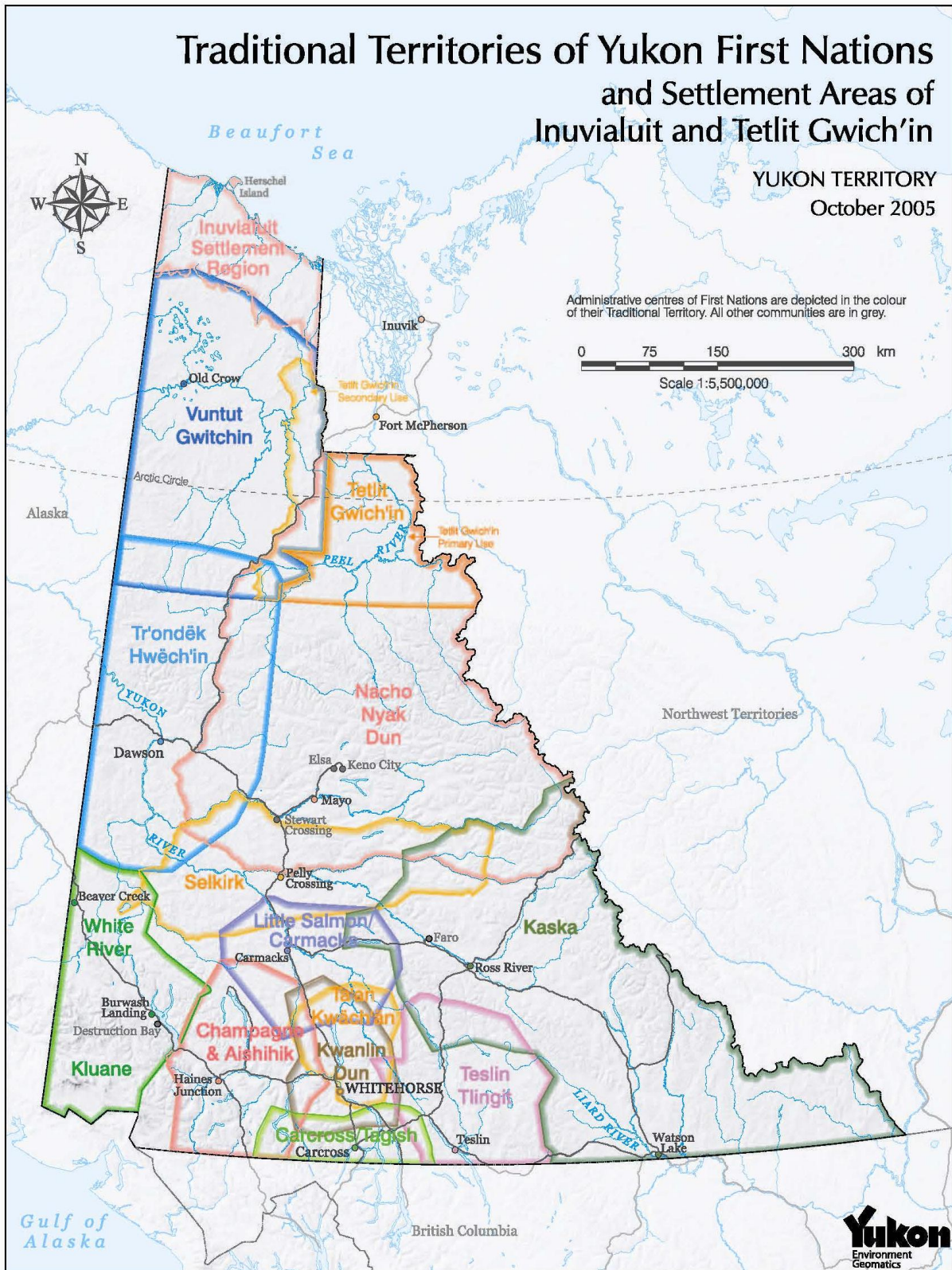
Figure 1: Map of the Yukon depicting the location of First Nation Traditional Territories. Map produced by the Department of Environment, Government of Yukon.