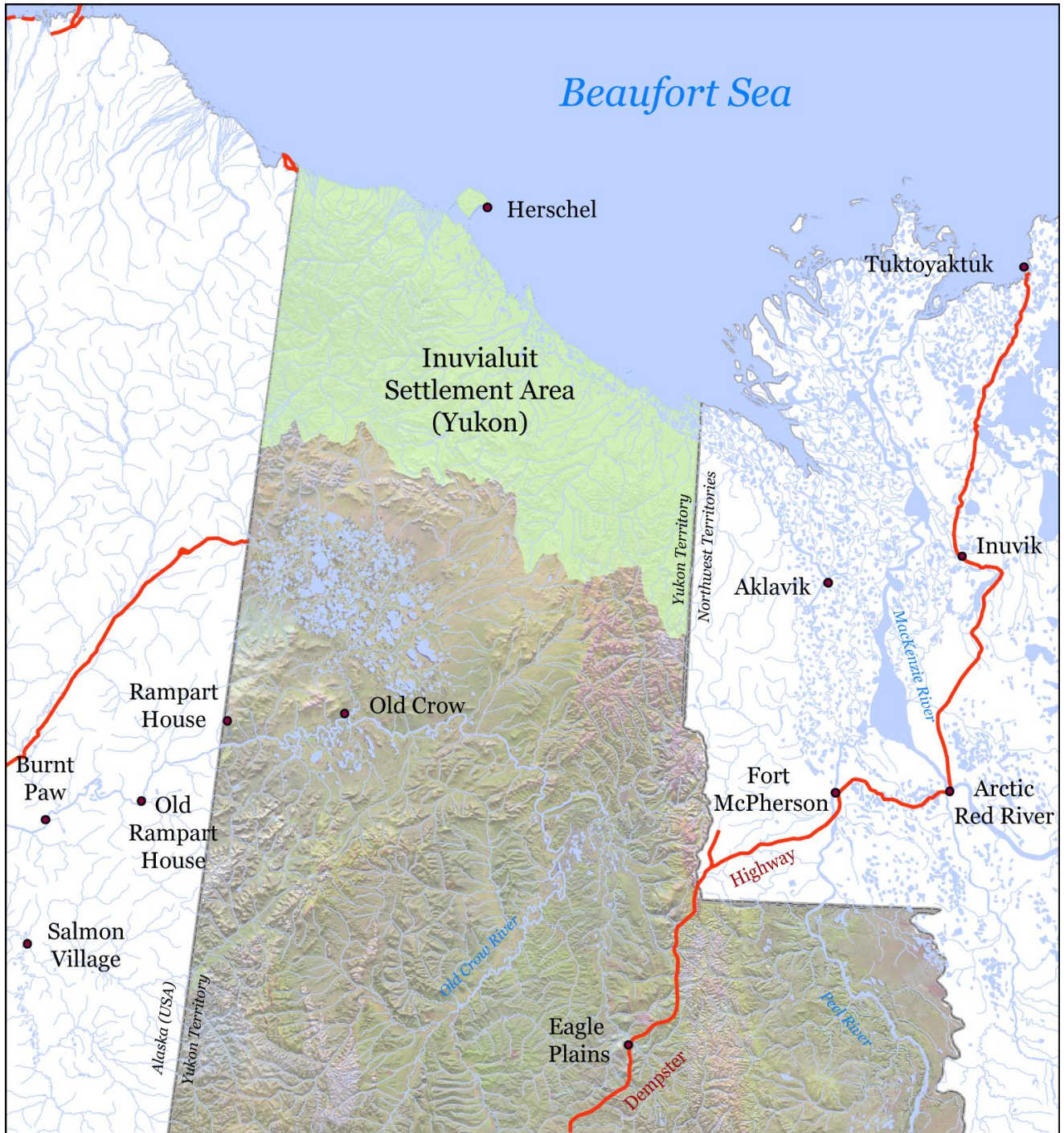
Figure 3: Map of the Yukon showing the Inuvialuit Settlement Area.