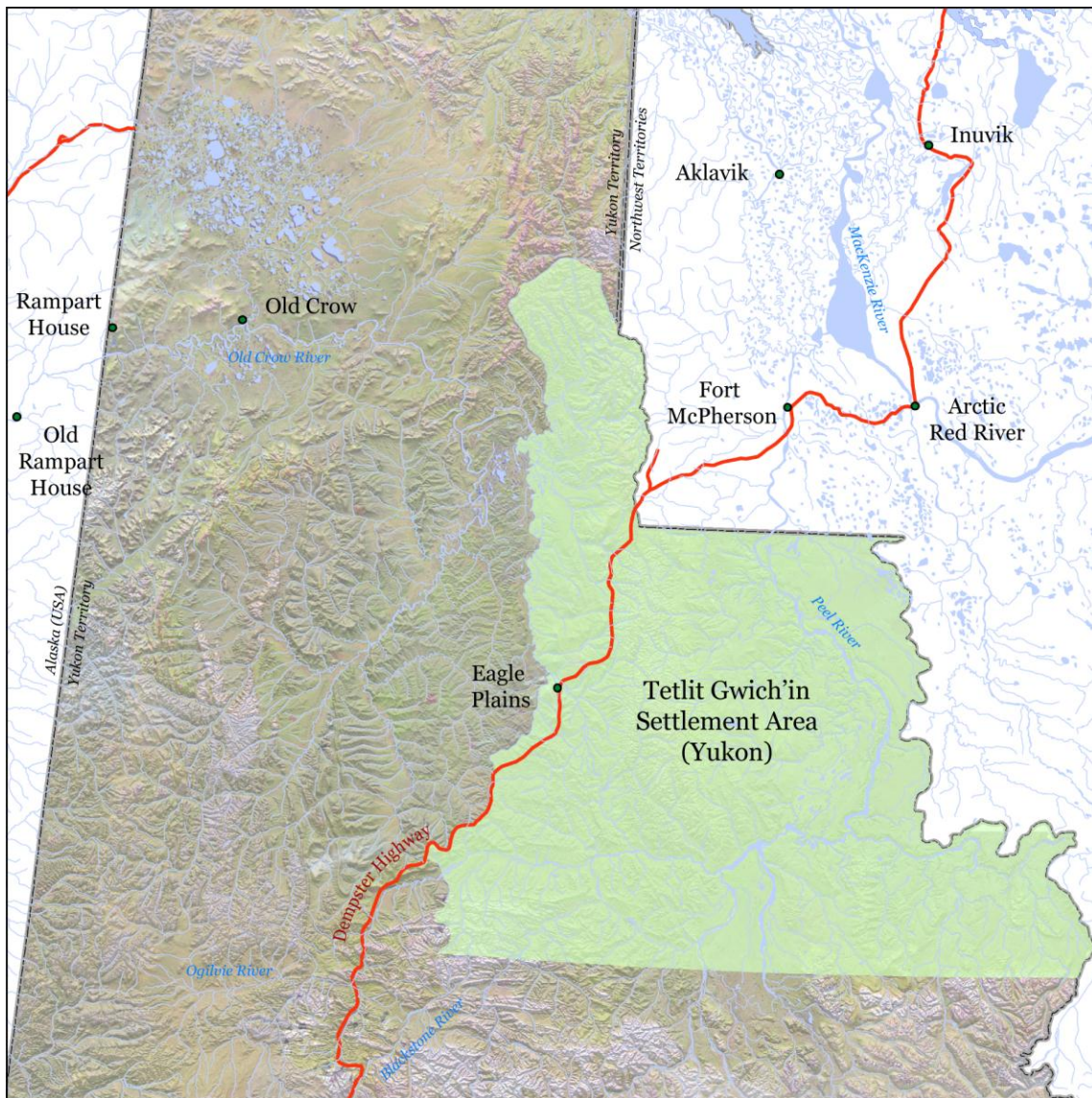
Figure 2: Map of the Northeast Yukon showing the Tetlit Gwich'in Yukon lands.

Gwich'in Land Administration Land Administrator PO Box 118 Aklavik, NT X0E 0A0 Tel: (867) 978-2340 Fax: (867) 978-2937